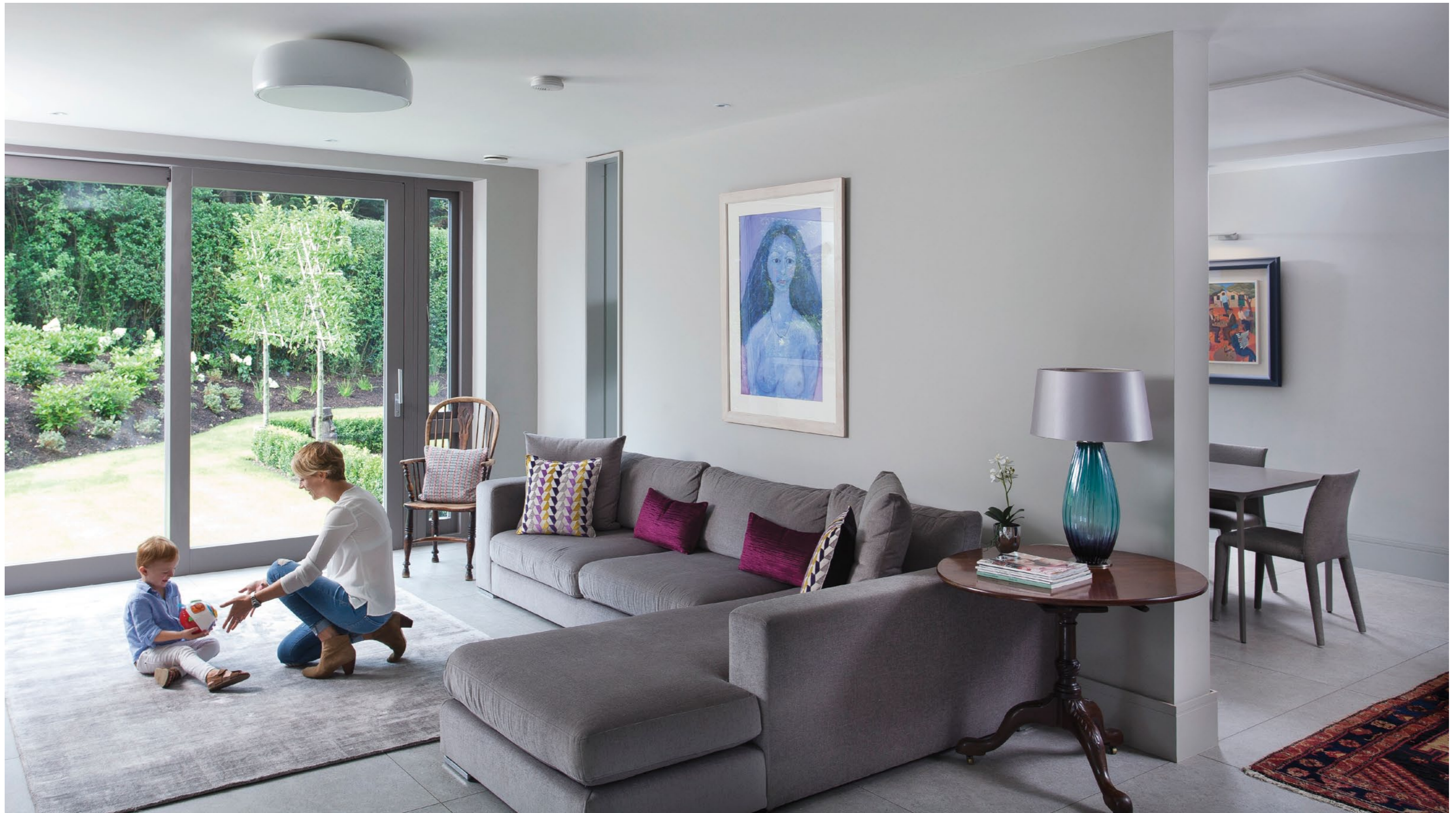
Designed in a practical and sociable open plan layout, the kitchen, living and dining spaces are ideal for everyday family living and entertaining, with partition wall and tall slim window screening the dining area from the main living space. Rug, J'Adore Décor; porcelain floor tiles, Ceco; dining table and chairs, Living Space.