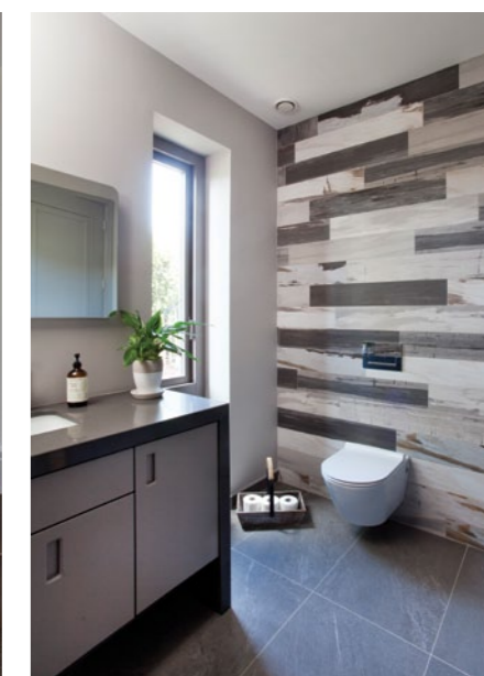
Part of a sociable and casual open plan layout, the dining area has been finished in warm tones, timeless in colour and contemporary in design. Texture has been added to the cloakroom with plank effect wall tiles and a sweeping staircase showcases the stunning architectural design. All tiling throughout, Ceco; dining table and chairs, Living Space; Flos Skygarden pendant light and all lighting throughout, Lightsource; bathroom sanitaryware throughout, Ceco; architecture, RPP Architects.