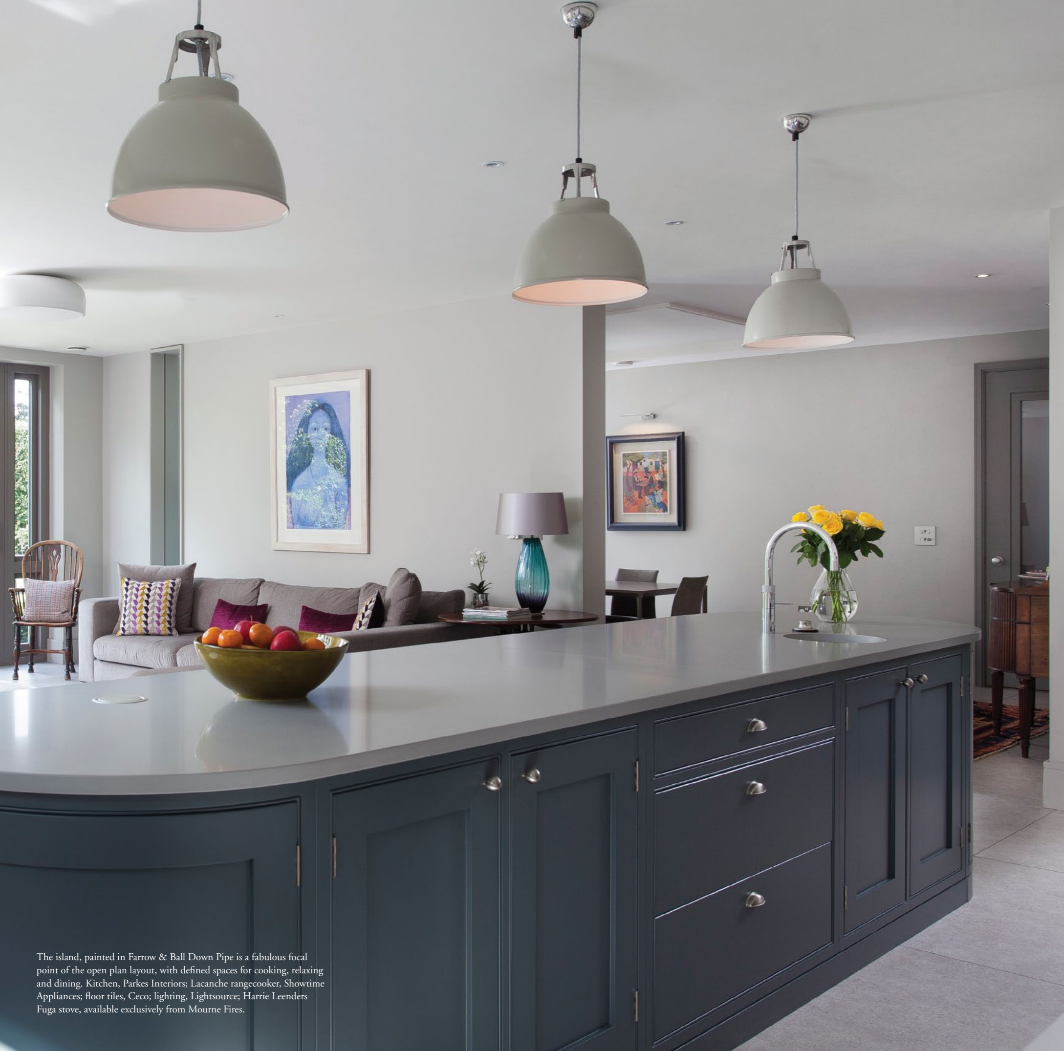
The island, painted in Farrow & Ball Down Pipe is a fabulous focal point of the open plan layout, with defined spaces for cooking, relaxing and dining. Kitchen, Parkes Interiors; Lacanche range cooker, Showtime Appliances; floor tiles, Ceco; lighting, Lightsource; Harrie Leenders Fuga stove, available exclusively from Mourne Fires.