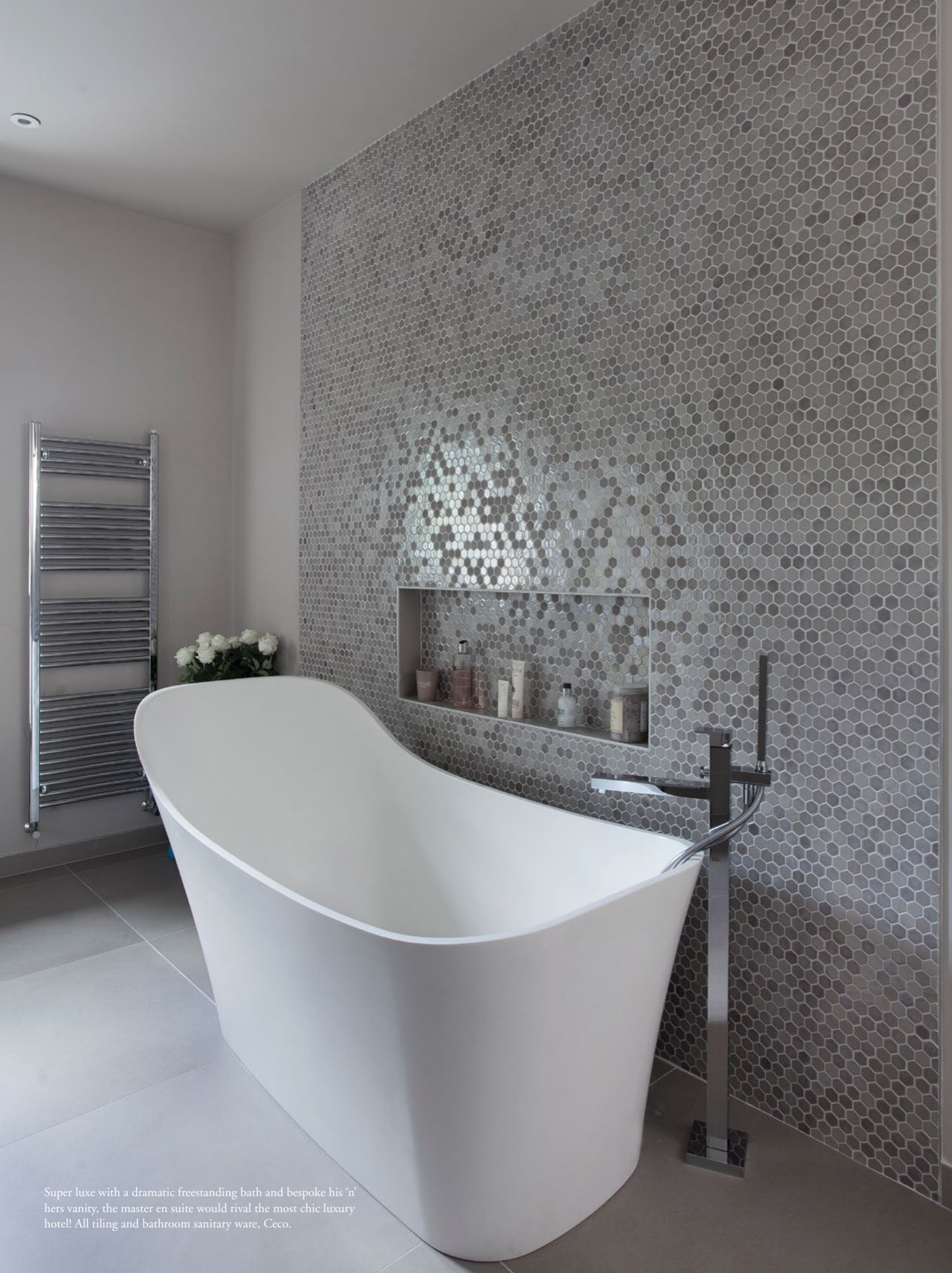
Super luxe with a dramatic freestanding bath and bespoke his 'n' hers vanity, the master en suite would rival the most chic luxury hotel! All tiling and bathroom sanitary ware, Ceco.