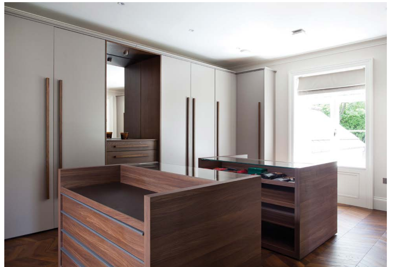
The master bedroom has been designed with adjacent dressing room, with other accommodation designed to comfortably accommodate the couple's children and grandchildren. Bed, And So To Bed; bespoke ottoman, J'Adore Décor; dressing room; Function Design.