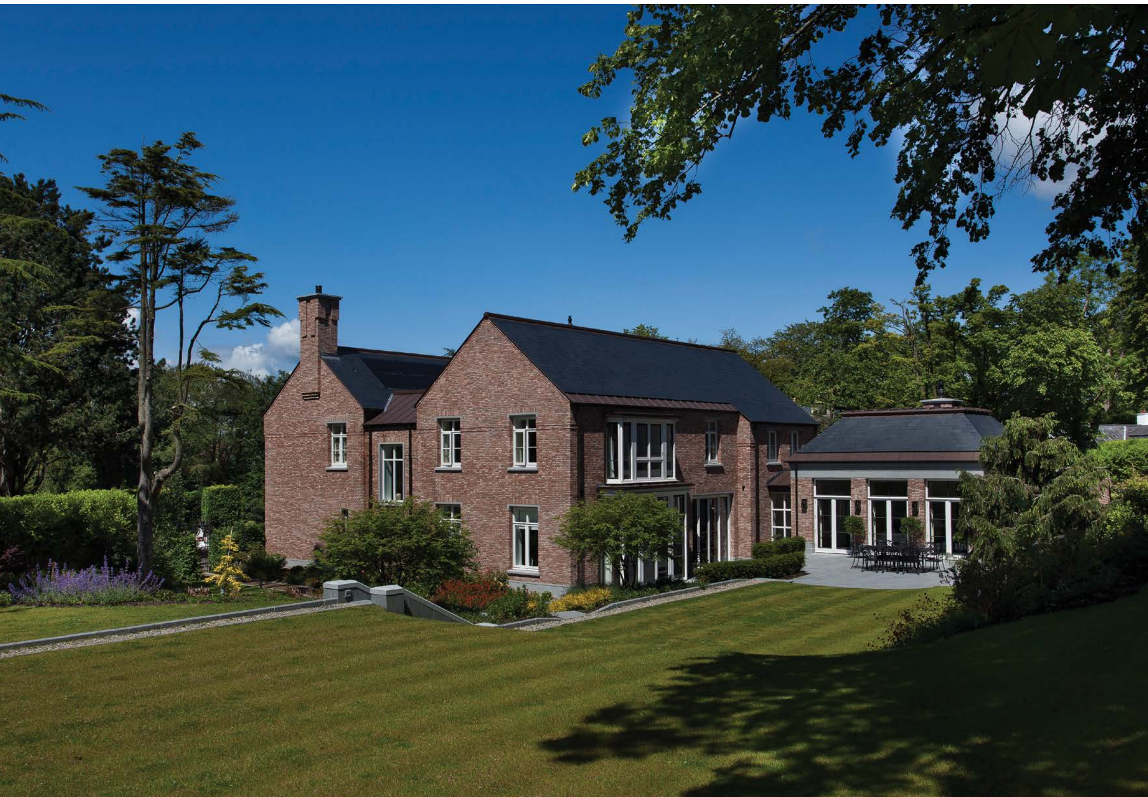
THE SOUTH-FACING GARDEN PAVILION ANCHORS THE GARDEN WITH THE HOUSE, ITS ARCHITECTURE INSPIRED BY A PAVILION GARDEN RESTAURANT IN RIEMS, OWNED BY ONE OF THE FRENCH CHAMPAGNE HOUSES.