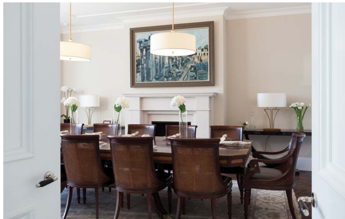
Above: An elegant, more formal look has been created in the dining room. Dining furniture, Harrods; console tables and sideboard, J’Adore Décor. Opposite: A bespoke table from J’Adore Décor furnishes the welcoming reception hall with bespoke architectural ceiling moulding. Tiling, Ceco.