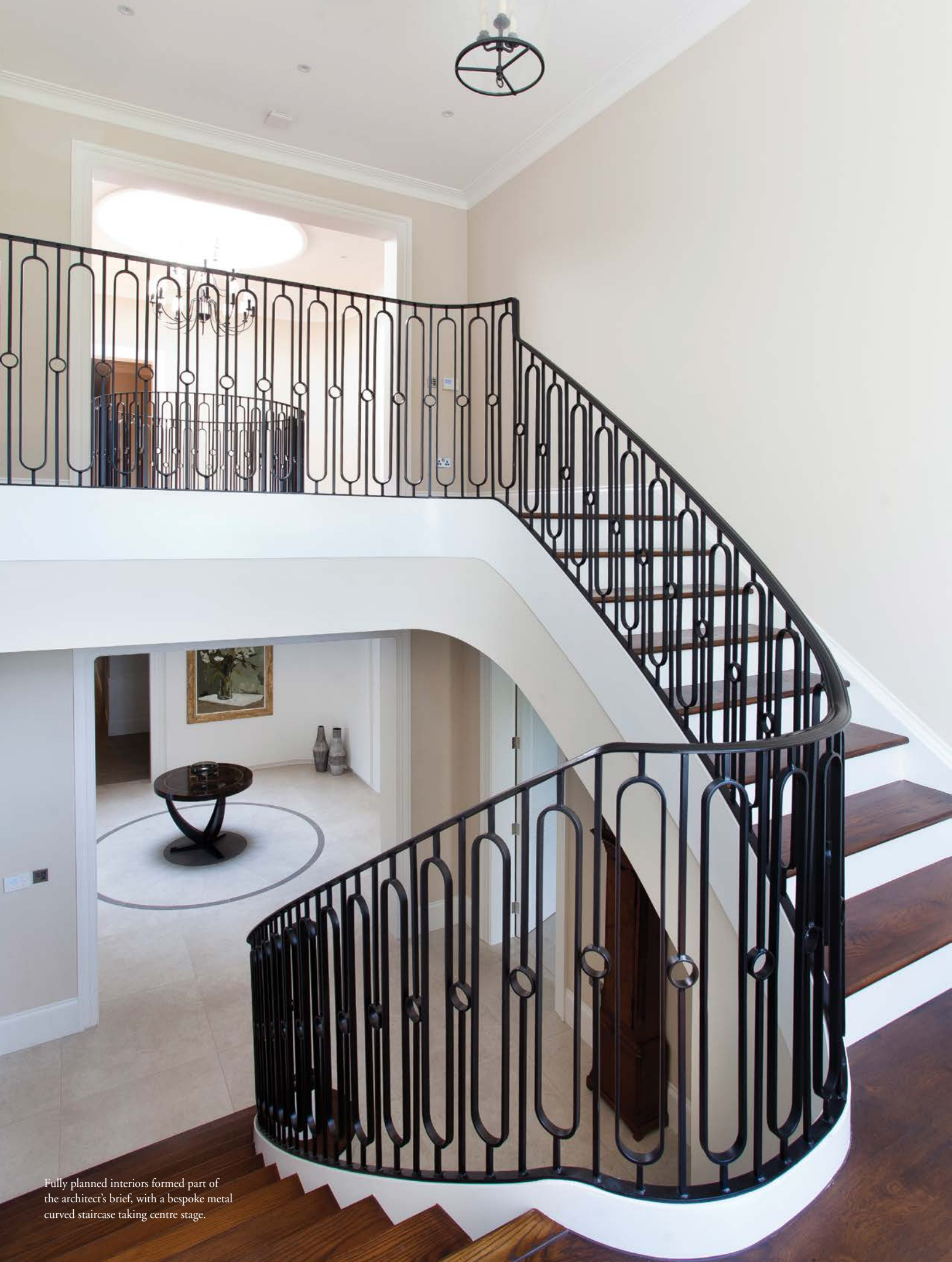
Fully planned interiors formed part of the architect's brief, with a bespoke metal curved staircase taking centre stage.