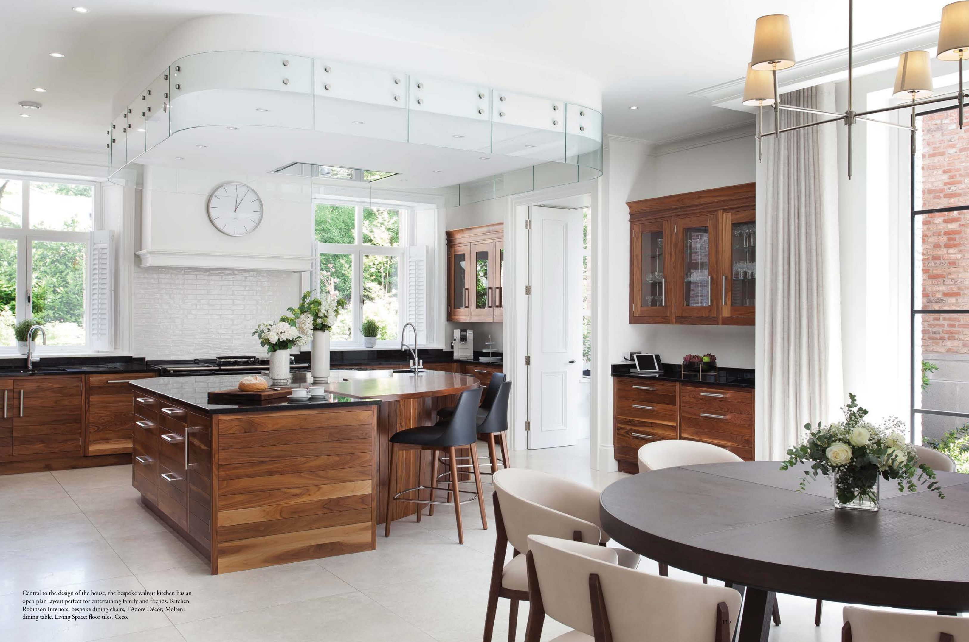
Central to the design of the house, the bespoke walnut kitchen has an open plan layout perfect for entertaining family and friends. Kitchen, Robinson Interiors; bespoke dining chairs, J'Adore Décor; Molteni dining table, Living Space; floor tiles, Ceko.