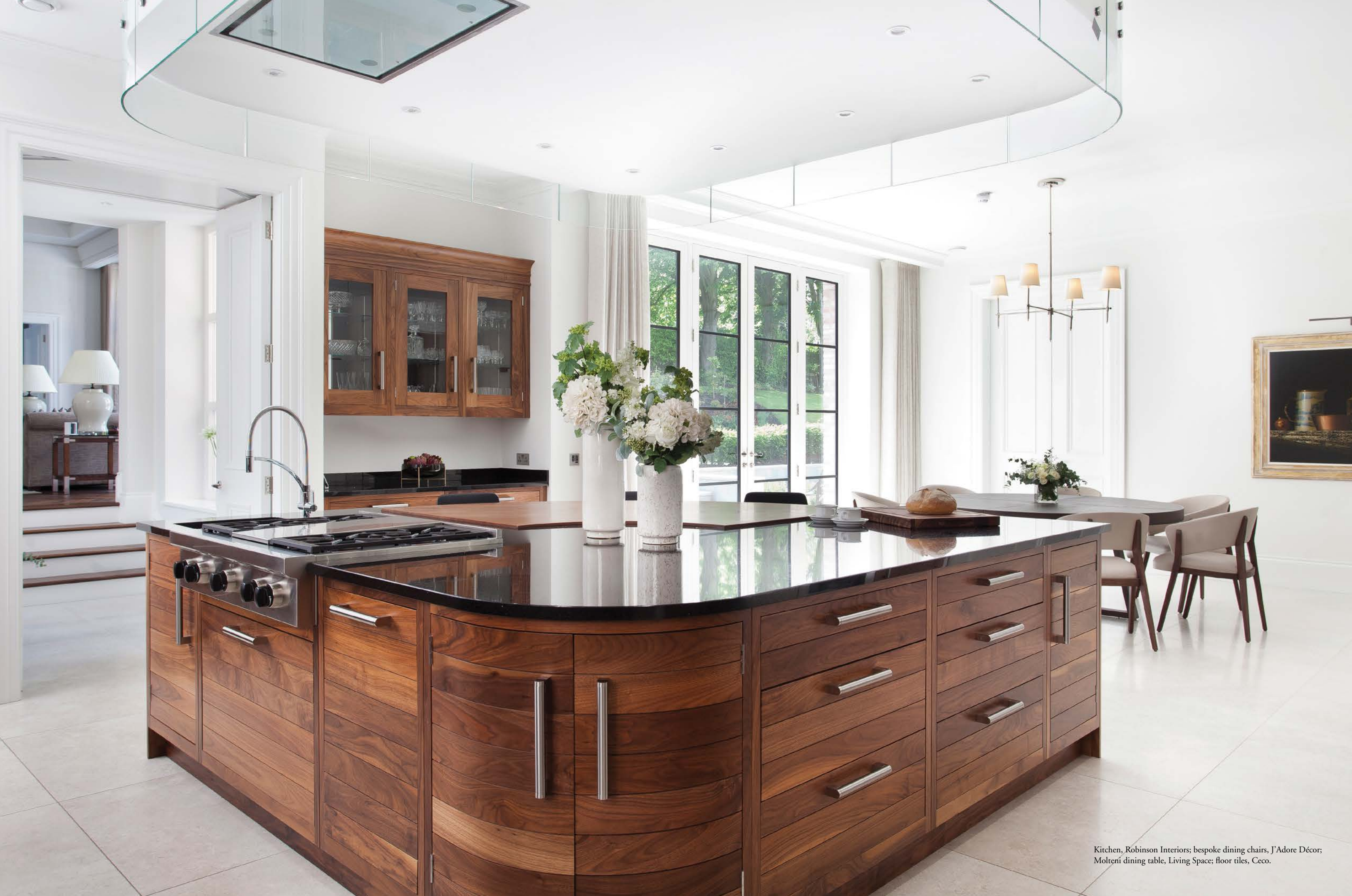
Kitchen, Robinson Interiors; bespoke dining chairs, J'Adore Décor; Molteni dining table, Living Space; floor tiles, Ceco.